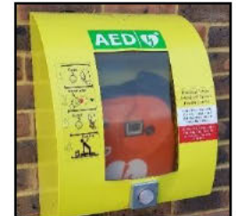
Typical AED Housing