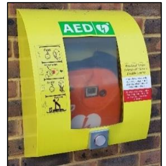
Typical AED Housing